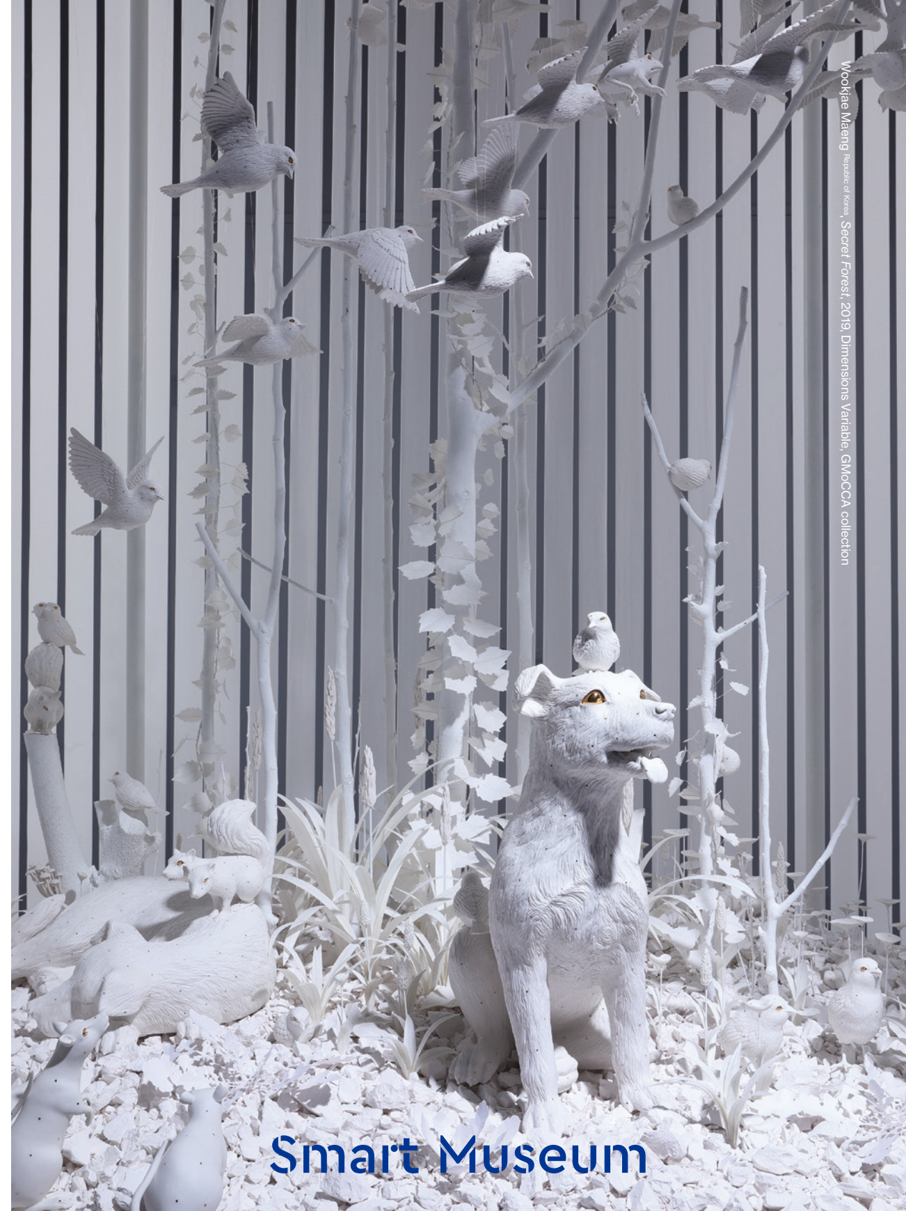
Wookjae Maeng, Republic of Korea, Secret Forest, 2019, Dimensions Variable, GMoCCA collection