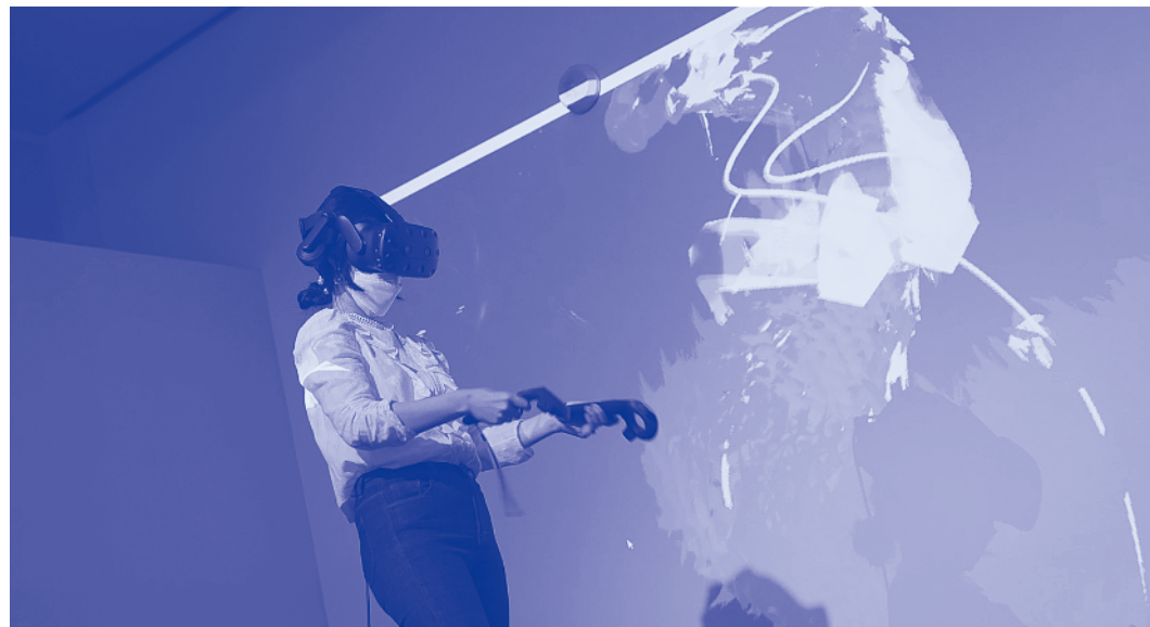
Painting in VR (Tilt Brush)