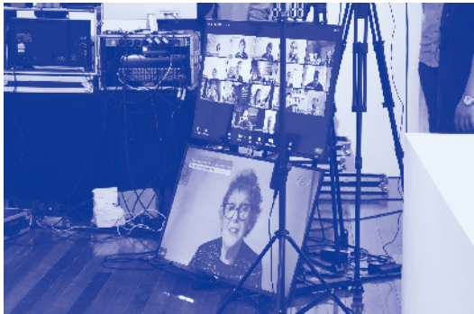
Online Exhibition Preview of A Story Beyond the Sea: Dutch Ceramics Now , 2021