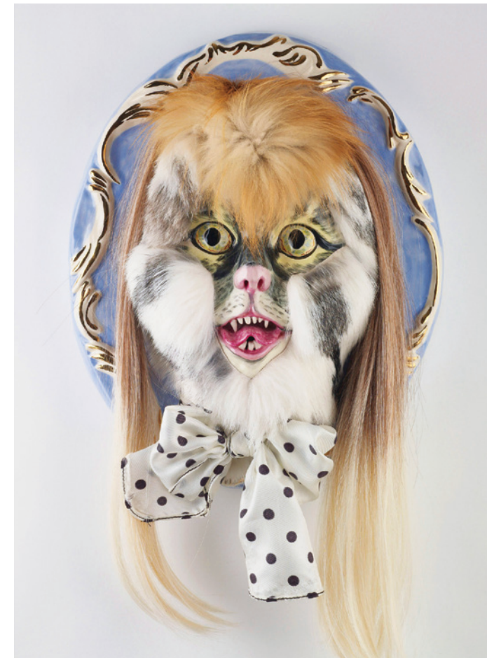
Shary Boyle Canada , Rage De Lux , 2012, 26x30cm, GMOCCA collection