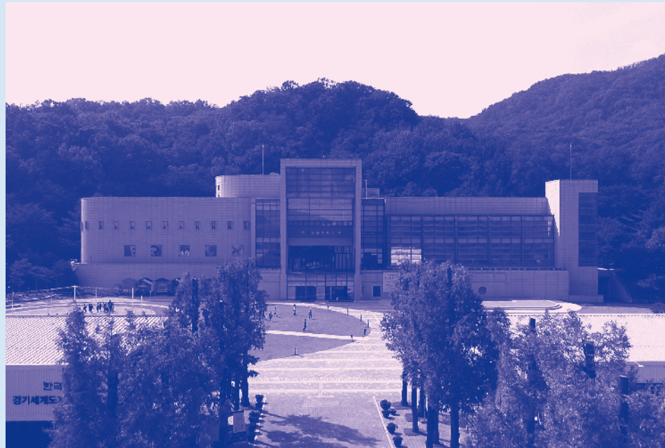
GMoCCA, Icheon, Korea

To make ceramic art a part of everyday life of Gyeonggi-do Province – and thereby make life richer for all – the Museum will strive to be closer and more familiar to the public. As an important center of world ceramics, the Museum is committed to increasing the values of ceramic art by incessantly communicating with the world.