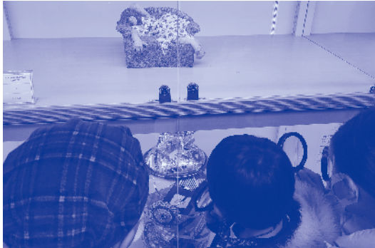
Education on How to Appreciate Art Collections, 2022