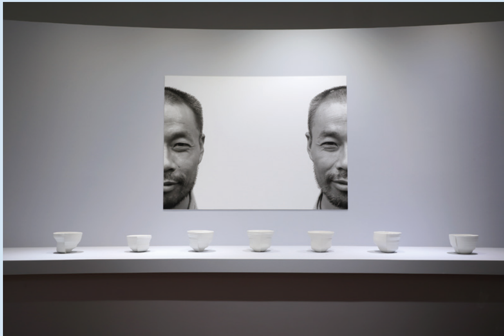
Philippe Barde Switzerland , Human Bowl Faces , 2004, Dimensions Variable, GMoCCA collection

Gyeonggi Museum of Contemporary Ceramic Art 263, Gyeongchung-daero 2697beon-gil, Icheon-si, Gyeonggi-do, Republic of Korea +82 31 645 0730