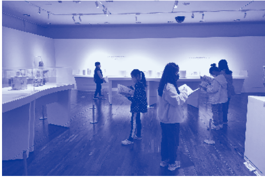
Oh! Harmony of Senses, 2022