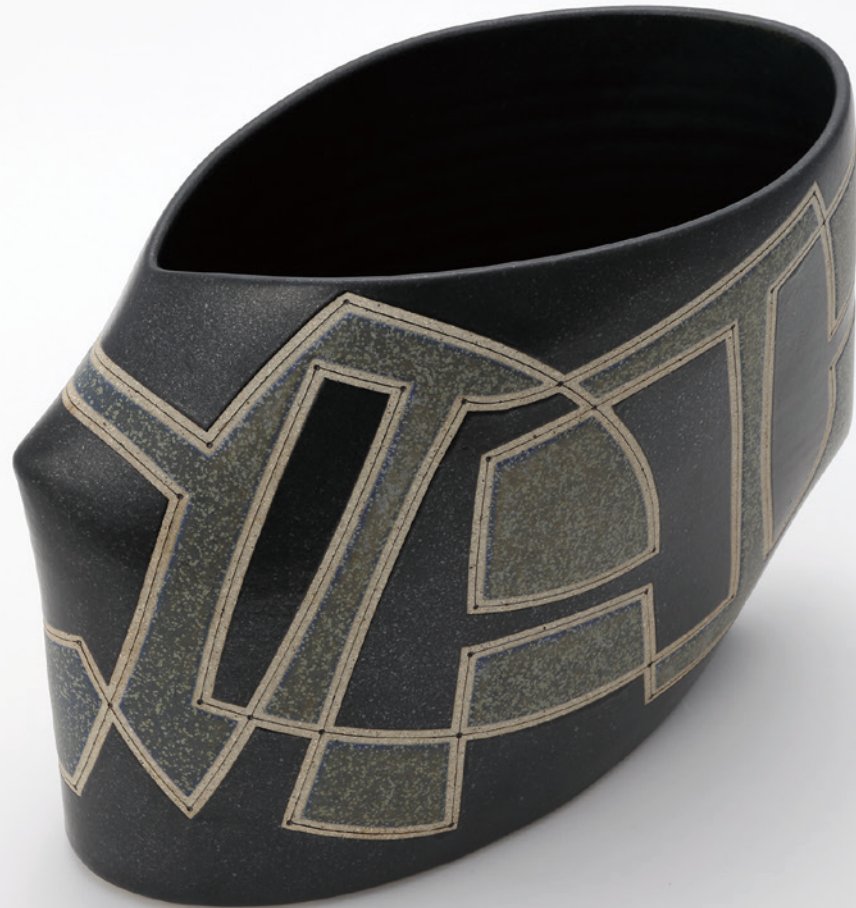
Gustavo Pérez Méndez, Untitled , 2004, 31x15x23cm, GMoCCA collection

A museum that connects with the public through artistic experience