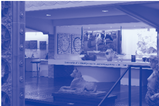
Hidden Colours: Contemporary Korean Ceramic Art , 2022 ©Alain Leprince – Roubaix, La Piscine museum

Stephen Bird Australia War is Over If You Want It to Be 2017, 53x45cm GMoCCA collection